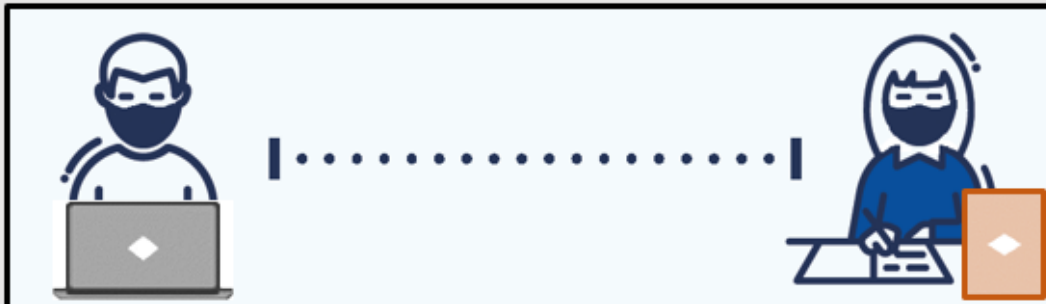
Face to Face Learning